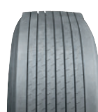
305/70 R 22 XPMA TL

Numerous grooves for high service versatility. Excellent resistance to stress.