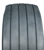
150/75 R 8 XGM TL

Specially designed for rolling on electric rail. Compact size. Excellent mileage and very good form of wear.