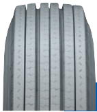
10 R 22.5 X METRO TL

Excellent wear form. Easier to mount on monoblock wheel. Reduced dimensional box.