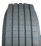
200 R 15 X METRO TL

The reference guide tire designed to be used on electric rails. Excellent mileage and even wear.