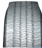
390/75 R 16 X METRO TL

Good load-carrying capacity. Optimal wet grip thanks to numerous sipes. Excellent wear form thanks to a summit construction with a zero-degree continuous steel wire (inificoil).