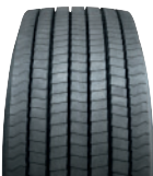
315/70 R 20 XPMD TL

Reduction of noise using non-siped ribs. Monoblock wheel mounting for optimized seat diameter and enhanced safety.