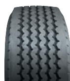
445/65 R 22.5 XZA TL METRO

The most important load capacity for a Metro tire. Optimal wet grip thanks to numerous sipes.