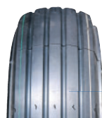
6.00 R 9 XPMC TL

Specially designed for rolling on electric rail. Compact size. Excellent mileage and very good form of wear.