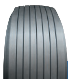
305/75 R 20 X METRO COMFORT TL

Optimized grip thanks to numerous sipes. Monoblock wheel mounting for optimized seat diameter and enhanced safety.