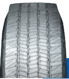
385/65 R 22.5 X METRO HD TL

Exceptional load capacity. Optimal wet grip thanks to numerous sipes.