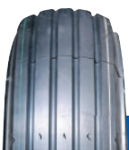
6.00 R 9 X TYPE P TL

Good wear form and excellent resistance to aggressions. Polyvalence of usage for all types of trains.