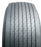
305/75 R 20 X METRO TL

High load capacity. Optimal wet grip thanks to numerous sipes.