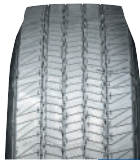
345/85 R 16 X METRO TL

Good load-carrying capacity. Optimal wet grip thanks to numerous sipes. Excellent wear form thanks to a summit construction with a zero-degree continuous steel wire (inificoil).